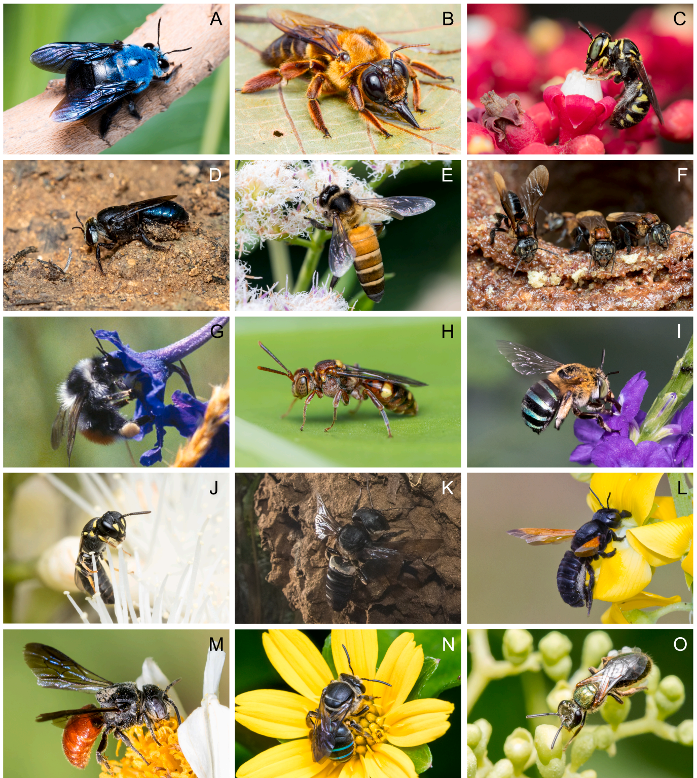
Fig. 1. Asian bee biodiversity. Apidae: A. Xylocopa insularis Smith; B. Xylocopa myops Ritsema; C. Ceratina collusor Cockerell; D. Ctenoplectra chalybea Smith; E. Apis dorsata Fabricius; F. Geniotrigona thoracica (Smith); G. Bombus supremus Morawitz; H. Nomada adusta Smith; and I. Amegilla andrewsi (Cockerell). Colletidae: J. Hylaeus penangensis (Cockerell). Megachilidae: K. Megachile pluto Smith; L. Megachile atrata Smith; and M. Euaspis polynesia Vachal. Halictidae: N. Nomia iridescens Smith and O. Lasioglossum adonidiae (Cockerell).

reduction of pesticide use and pollution of water, light, and air; increase in landscape heterogeneity and semi-natural areas; implementation of pollinator-friendly practices across landscapes; protection and restoration of biodiverse areas and threatened species; and control of alien