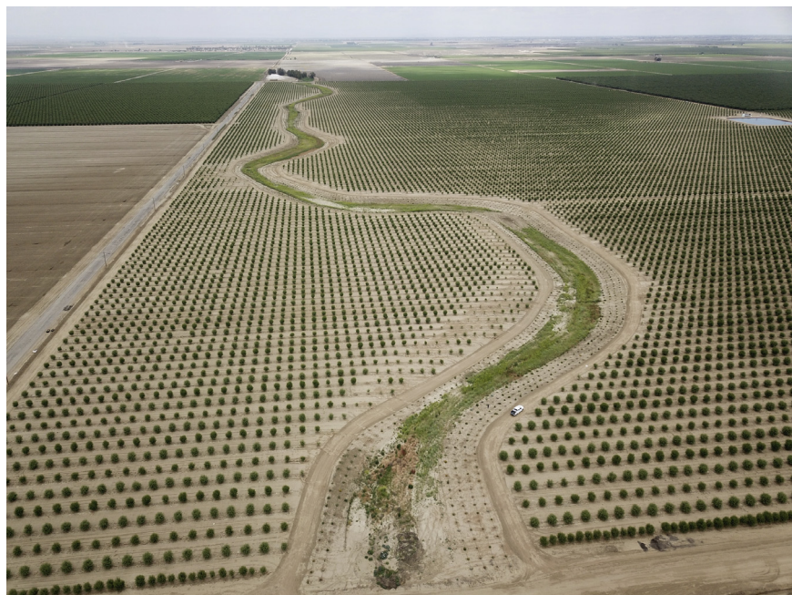
Trends in Ecology & Evolution

services increases with spatial scale as the number of crop types accumulates, as demonstrated for crop pollination [15]. For large-scale farms, there are many examples of extensive networks of flowering strips between production units (Figure 2), with multiple benefits for both crop pollination and biotic pest regulation [7]. To support healthy populations that provide ecosystem services to all farms in a region, agricultural policies in the EU promote green infrastructures that facilitate connectivity across crop dominated landscapes (Table S1). Such strategic, landscape-scale conservation demands coordinated actions that can be beyond the means of individual land managers [16]. Support can be provided for farmers to work together, such as in the Countryside Stewardship facilitation fund in England that supports coordinated action by 'farm clusters' (Table S1).