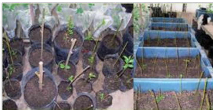
Figure 2. Macropropagation of Salix humboldtiana