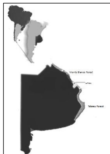
Figure 1. Location of natural forests (Talares and Monte Blanco) in Buenos Aires Province, Argentina.

Another relict forest ecosystem in Buenos Aires is the locally named Monte Blanco. This forest, that originally occupied the elevated border areas of the Low Delta islands of the Río Paraná and some areas of Río de La Plata river coast, has almost been eliminated as a consequence of unsustainable timber harvesting carried out in the region during the past century. At present, only relict patches with scarce regional representation may be found along the north-eastern part of the Río de La Plata shore. Many of these forests have been abandoned, resulting in secondary forest formation that is subject to numerous invasive exotic species, such as Ligustrum lucidum , Morus alba , Rubus ulmifolius , Gleditsia triacanthos , Fraxinus pennsylvanica and other species. A priori observations suggest that successional trends do not lead to recovery of the original forest. Because of the low density of native tree species, it is difficult to predict their future persistence. In conclusion, ecological restoration strategies will be needed in order to increase native tree species richness and forest biodiversity in the Lower Delta of the Paraná River, the original forest, locally referred to as the Monte Blanco forest (Kalesnik et al. 2008).