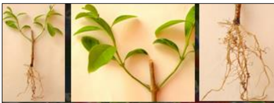
Figure 3. Cuttings of Citharexylum montevidense