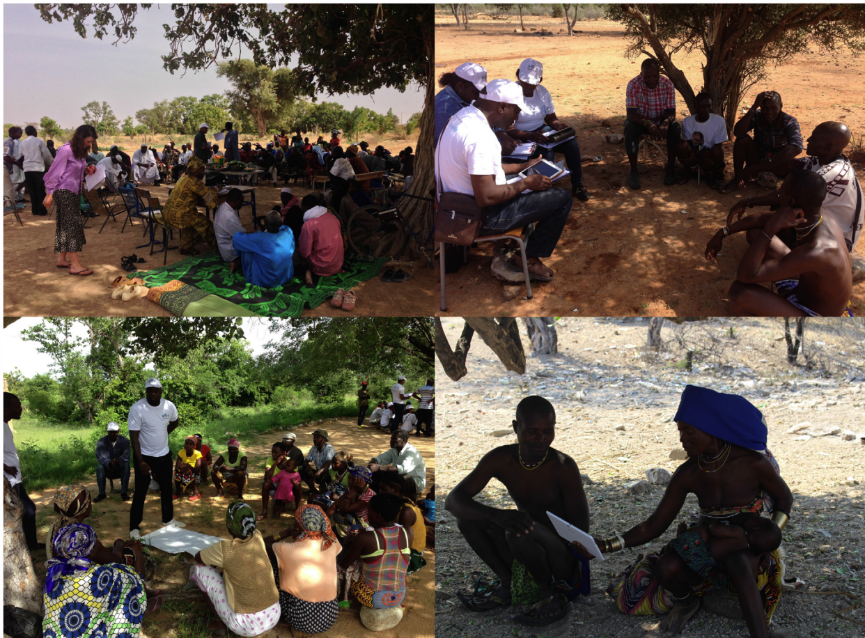
Trends in Ecology & Evolution

With the goal of creating a place to share, learn, and engage, there are several attributes that would be beneficial. Ideally, the tool would connect farmers to farmers, scientists to scientists, programme managers to programme managers, and between each of these groups. Attributes needed for developing and implementing a knowledge sharing platform are: (i) location: online, but with data and videos downloadable; (ii) user friendly: easily shareable (viewable) and available in multiple languages [73]; (iii) multilayered: providing both an interface that is aimed at sharing information with people on the ground (e.g., farmers), as well as a set of case studies and peer-reviewed articles backing up the information. It is important to provide best practices (e.g., Digital Green through the use of farmer-developed videos); (iv) interactive: providing a space for farmers to comment and discuss among themselves to ask questions and share answers; and (v) visual: a dynamic area that displays geographical and temporal information, such as practices used in different countries and impacts on resilience over time.