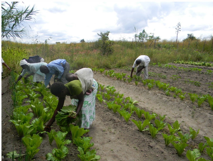
Trends in Ecology & Evolution

Current markets and economic indicators fail to capture the full range of (current and potential) benefits from farming systems to human wellbeing (e.g., water purification, oxygen production, nutrient recycling, or climate regulation). Given that many decisions on land use are based on markets and economic indicators, such failures can result in the loss of these benefits and land-management decisions that are poor from a social perspective. Indeed, many farming practices can cause increased erosion, salinization, soil compaction, chemical pollution of soil and water, and biodiversity loss, among other symptoms of degradation. Valuation of such benefits provides information to undertake corrective actions.