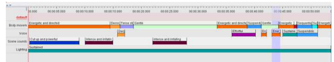
Figure 3. Bidonde’s time line analysis.

In Bidonde’s version, the lighting is constant. There are subsequent sequences of energy and release which are not elaborate in multimodal compositions with lighting like in Wilson’s but sometimes are combined with sounds.