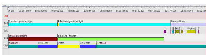
Figure 2. Wilson’s time line analysis.

As can be seen in fig. 2, in Wilson’s time line there are long phrases in movement, sounds and lighting. Contrasts and coincidences are carefully elaborated in multimodal compositions. In the first phrase, the intensity of sound opposes the gentleness of movement. In the second phrase, the fragile and delicate sound goes along with the sustained, gentle and light movement and the crescendo and sustained qualities of lighting. The frozen moments are carefully simultaneous.