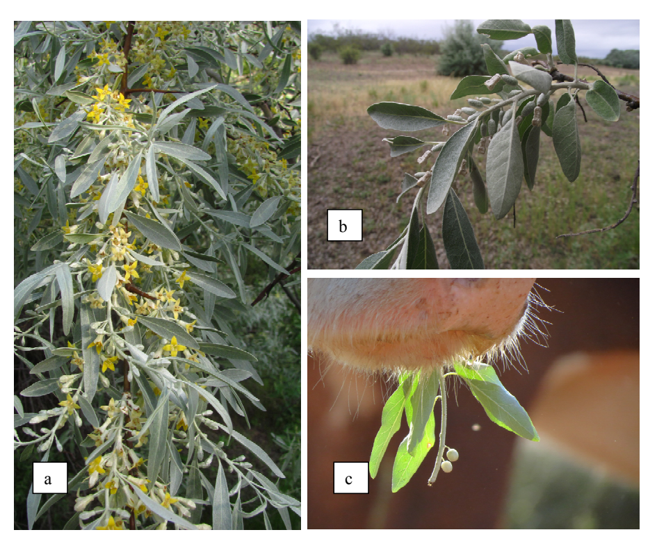
Fig. 3 Thyrses of E. angustifolia.

(a) Flowering stage, (b) immature fruits and (b) cows consume the entire thyrses.