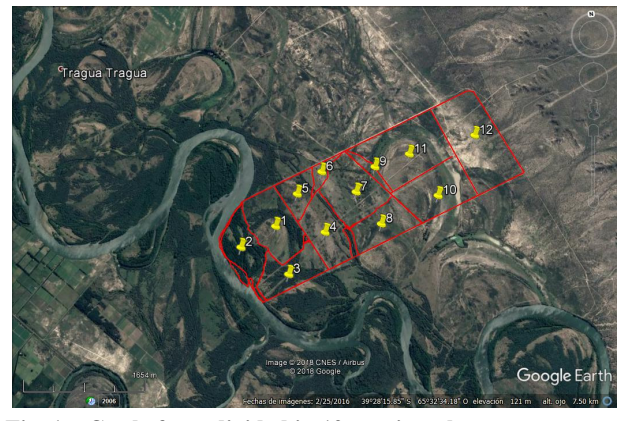
Fig. 1 Cattle farm divided in 12 grazing plots.

The farm has 12 parcels ranging from 7 to 100 ha, divided with traditional or electric fences to rotate