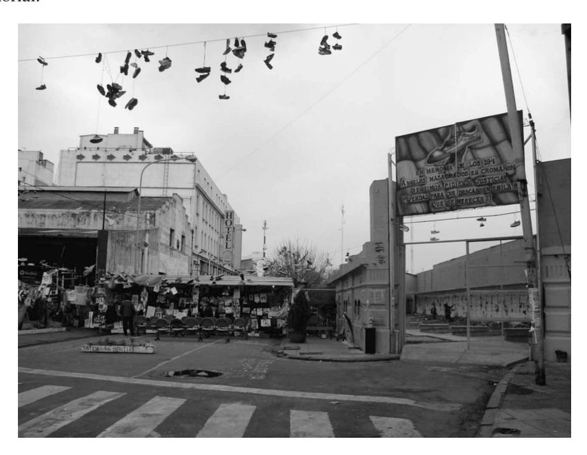
Figure 1. The Cromañón memorials.

The street where Cromañón is located in Buenos Aires has been blocked at one end by an informal memorial constructed by survivors and families of the victims (see Figure 1). This is the location from which commemorative marches have been initiated. As one approached the informal memorial in 2006, a large piece of graffiti in a planter box in front of the site stated 'Justice, stop lying!' ('¡Justicia, basta de mentir!'). In the floor, on the pavement, another piece of graffiti stated: 'The angels ask for justice from heaven' ('Los ángeles piden justicia desde el cielo'). Dozens of sneakers hung from street lampposts and telephone wires: during the fire and the subsequent melee the shoes of victims seem to have slipped from their feet, and around the city of Buenos Aires in the days after the disaster, sneakers hanging from cables and trees became ubiquitous. At the site itself, two rows of plastic benches had been placed in front of a plastic tent so people could sit at the memorial.