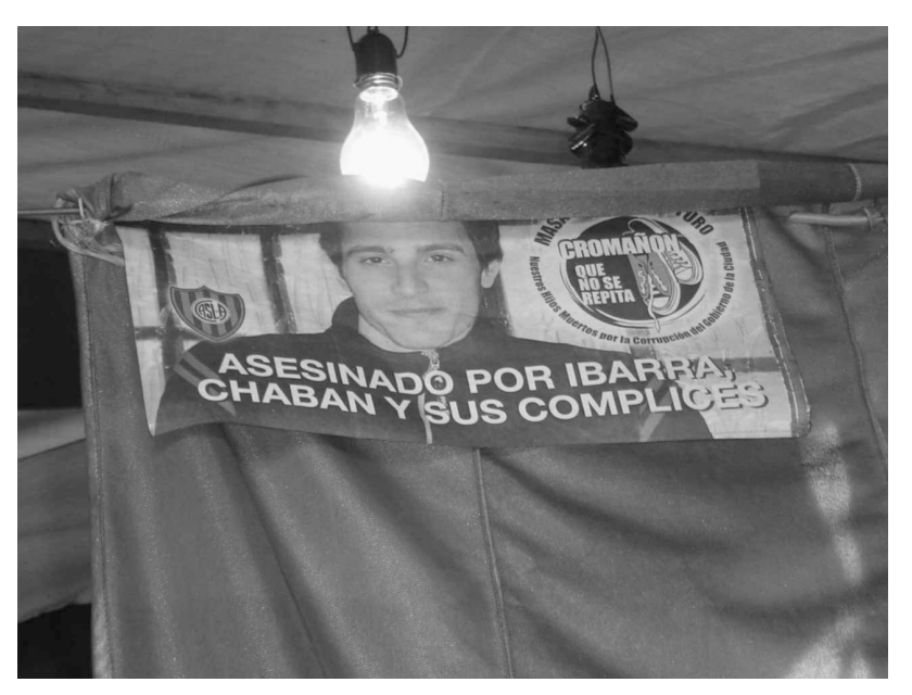
Figure 5. 'Asesinado por Ibarra'.

The development of the Cromañón remembrance sites, though spontaneous in many of their features, was not entirely random. To the attentive eye, they show distinctive patterns in their conformation – the constant hybridization of materials and meanings, the intersection of the private and public orders, the affirmation of the individuality of the victims combined with a constant appeal to collective identities. This complexity and