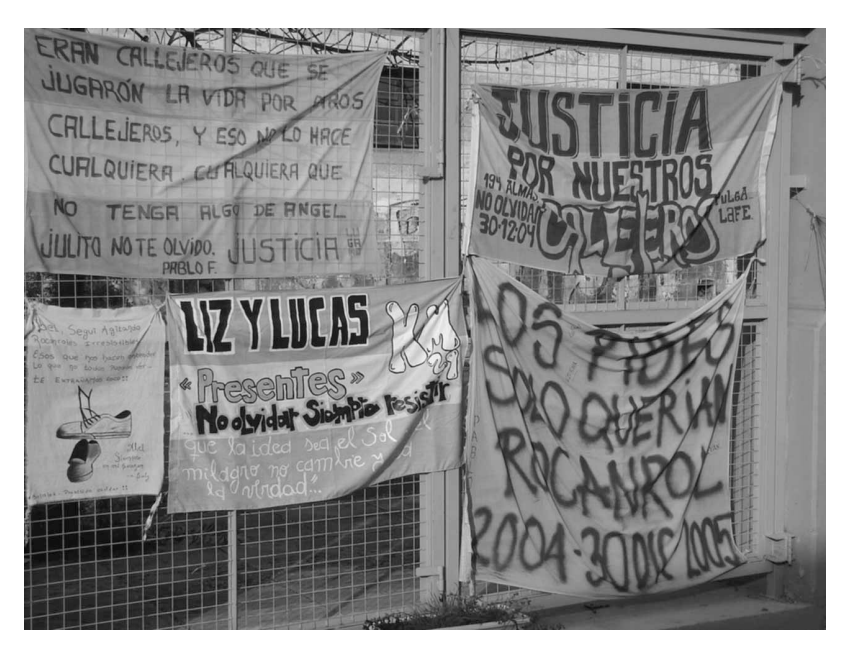
Figure 4. Banners.