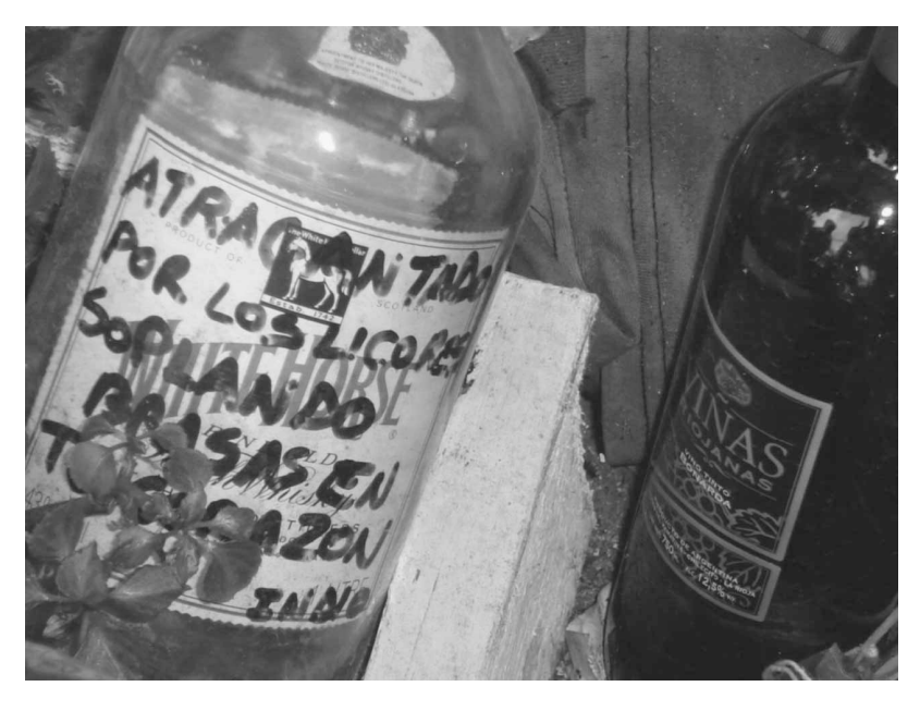
Figure 6. 'Soplando brasas en tu corazón'.

diversity of layers of meanings echo broader aspects of the prevailing forms of action and organization by families and friends of the victims.