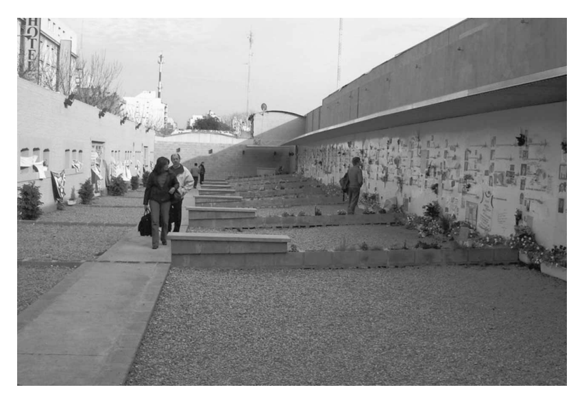
Figure 3. The municipal memorial.