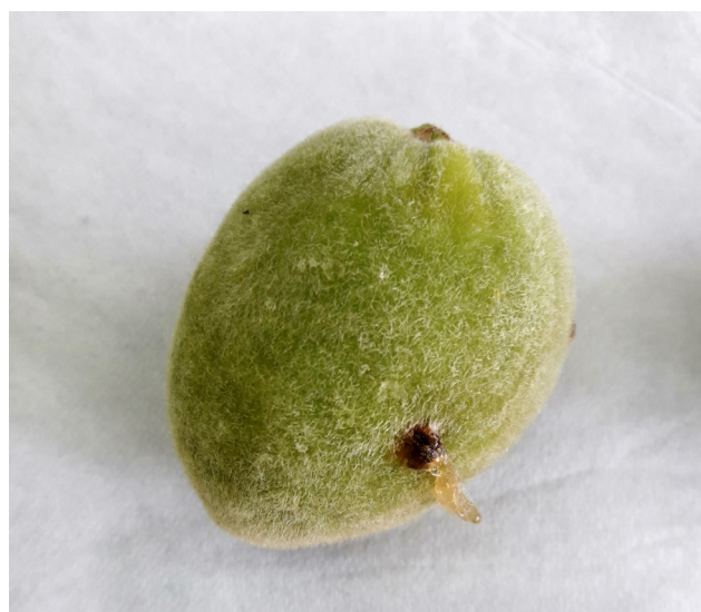
Figure 1. External symptoms of the disease on an immature almond fruit.

Pathogenicity tests were conducted on 8 healthy immature almonds fruits, 40 days after the setting, and the results were verified according to Koch's postulates. The disinfected fruits were injured at a depth of 0.1 mm in the