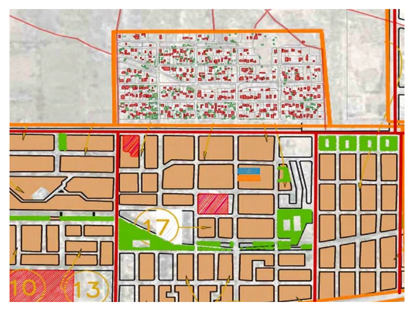
Figure 8.6 Interdependent relationships between the formal neighbourhood and the Toma Las 250 casas. General Roca, Argentina. Image: Luciano Idda (2014).

This settlement has a special peculiarity in that the spaces which families lack in the formal house unit (the parents' house) are reconstructed in the Toma, with spaces for social events such as dining incorporated into the precarious house, which, even with few or no facilities, becomes a meaningful central space for family relations and other existing social networks.