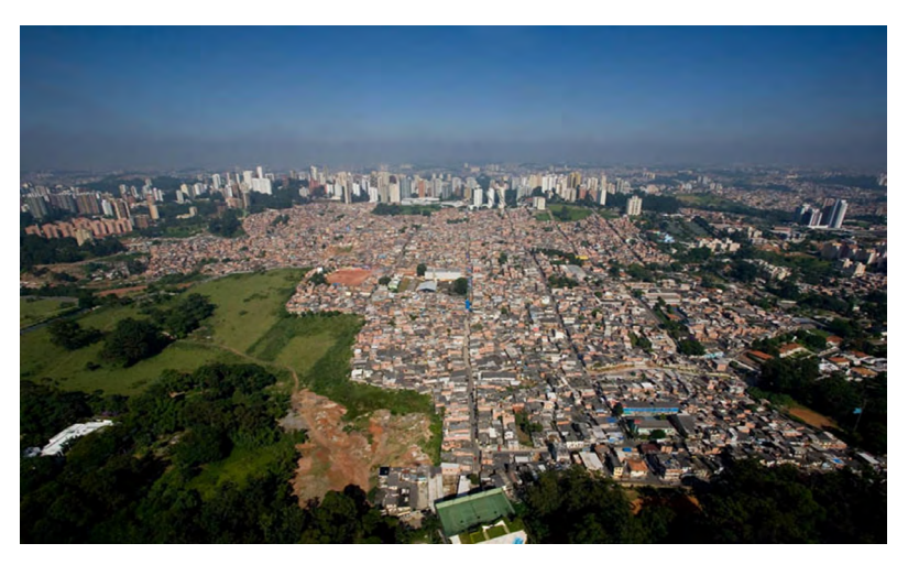
Figure 8.3 Aerial image of the Paraisópolis favela, Sao Paulo, Brazil, 2009.