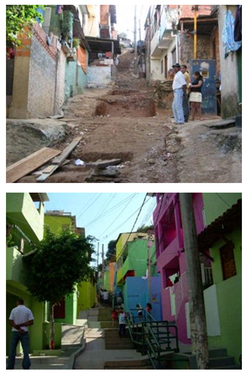
Figures 8.4 and 8.5 Public space in Paraisópolis, Sao Paulo, Brazil – before reconstruction (2009) and afterwards (2011).