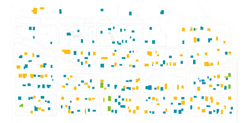
Figure 8.7 Toma Las 250 casas house distribution and classification.