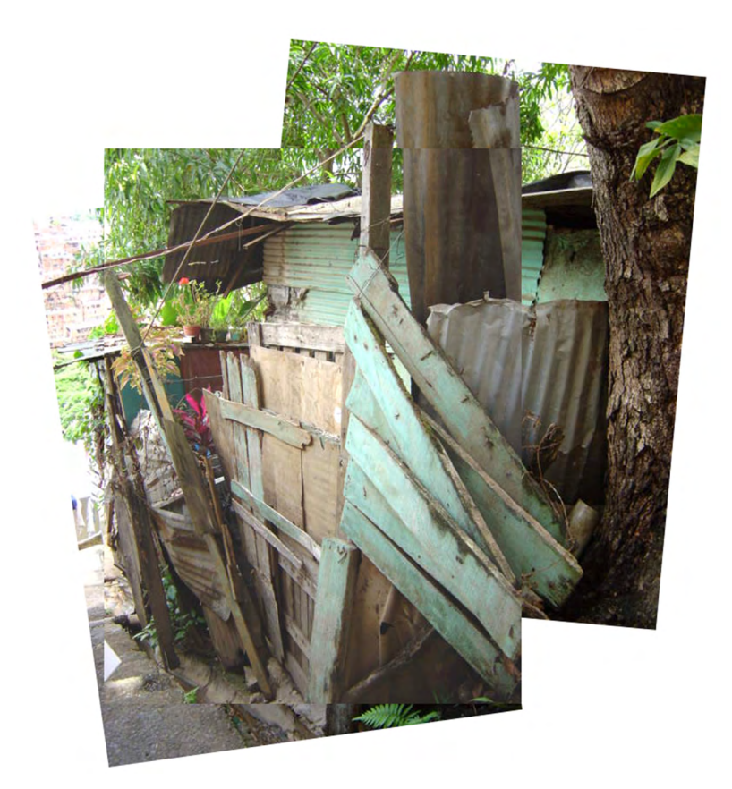
Figure 8.1 Exteriors of precarious homes, El Barrio Julián Blanco, Petare, Caracas, Venezuela, 2009.

families. From a poetic perspective, 'the house was magical: it stretched and shrank according to need. Perched halfway up a hill, it offered a panoramic view of the bay; there were four rooms on the first floor, and an apartment below...<sup>25</sup> This description is not entirely inaccurate, as the Venezuelan chabolas in the area of Caracas seem to hang, like pendants, from the surrounding hills. This vernacular architecture, which responds to the definition of opportunity, economy, availability of particular materials and local building techniques, is realised through land being occupied in an informal manner, with self-built houses distributed according to the topographic conditions and land availability. Such occupation is neither accidental nor casual. In fact, it is the result of the materialisation of invisible bonds built by families, through women, in pursuit of self-protection and mutual collaboration.